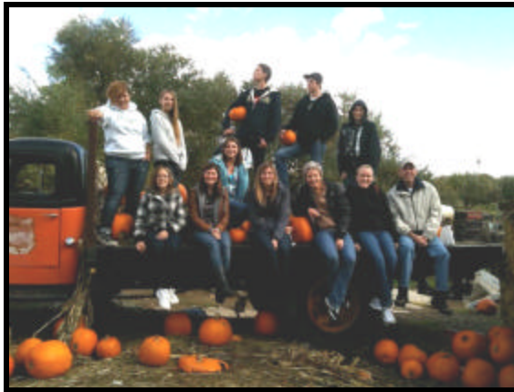
Left - YLTC Class of 2010/11at Covers Apple Ranch.